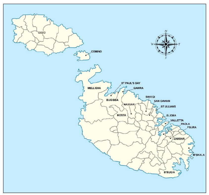
CHART NO. 1: MALTESE ARCHIPELAGO LOCATION OF TOWNS REFERRED TO

This is not considered as drastic as residential property losses that were registered in America or Europe where drops exceeding 30%-60% had been noted. As from 2013 property values started increasing again, with the previous 2007 property values, now equalized in 2014.